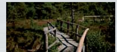
... marshy and uneven areas