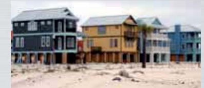
... sandy and soft soil types