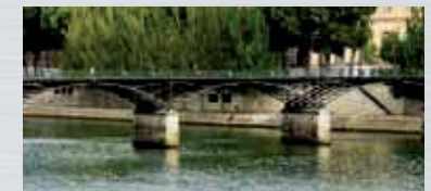
... river banks and rivers