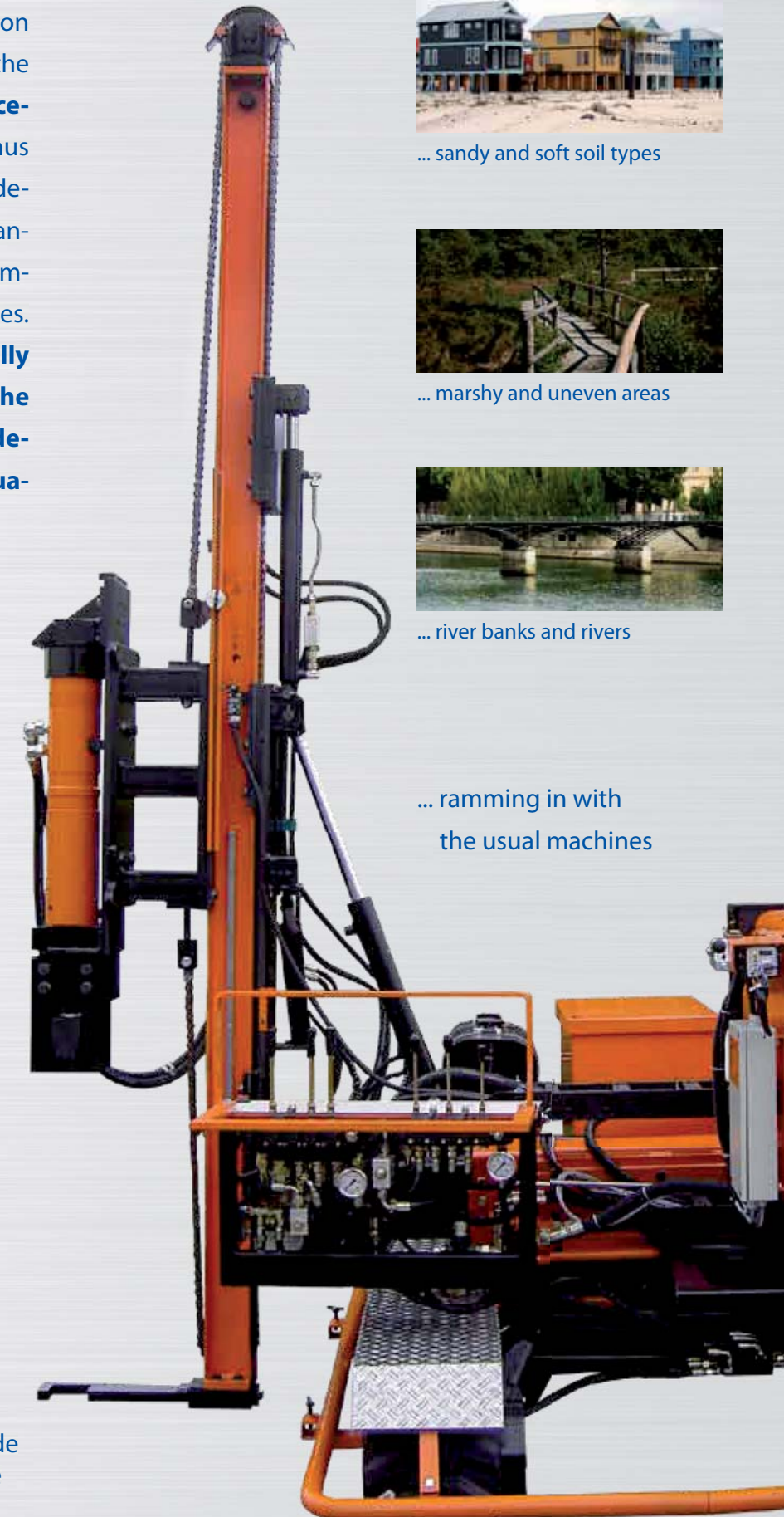
... ramming in with the usual machines