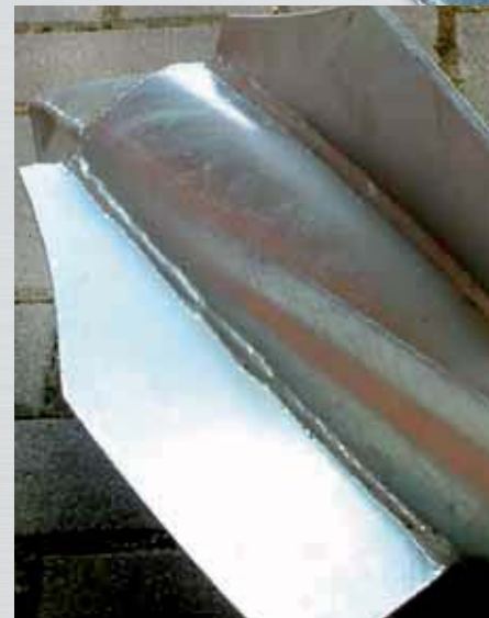
Very stable wings!