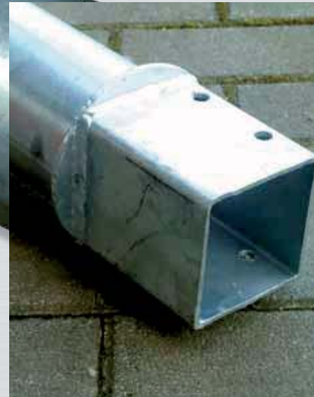
Attachments that fit!